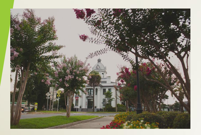
Courthouse – the Center of Town