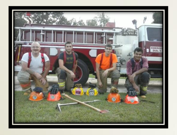
Some of our local heroes

The Monticello Volunteer Fire Department consists of dedicated men and women who express their love for our city by giving of themselves to assist and save others.