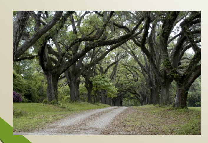
Local Canopy Road

As the only incorporated city in the county, Monticello boasts a delightfully diverse population with a proud heritage and is experiencing growth as the joys of small-town living become apparent to those seeking a quieter way of life, an inviting atmosphere, an active but charming downtown, and good folks to call neighbors and friends.