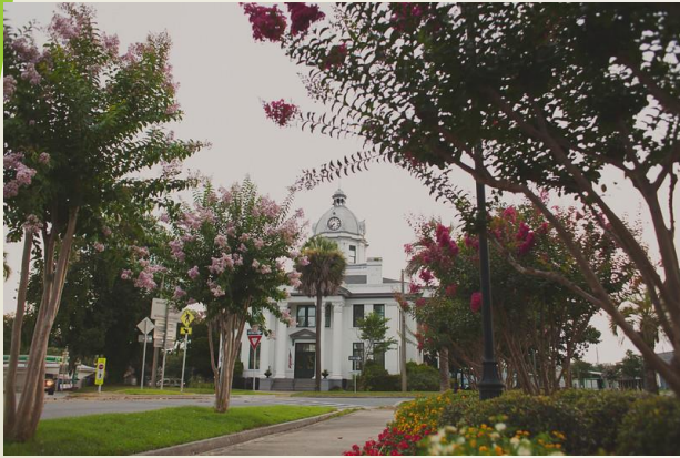
Courthouse – the Center of Town