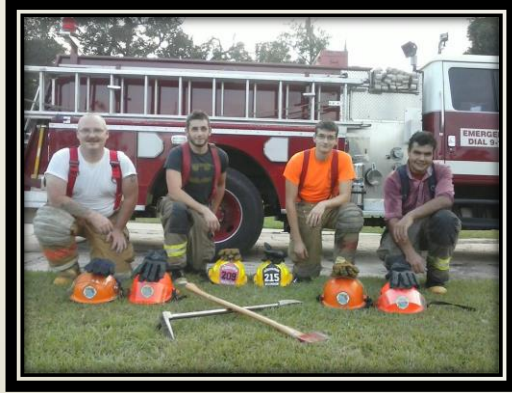
Some of our local heroes

The Monticello Volunteer Fire Department consists of dedicated men and women who express their love for our city by giving of themselves to assist and save others.