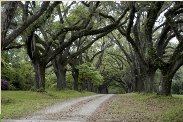
Local Canopy Road

Monticello, Florida, the county seat of the Jefferson County, is a small, peaceful city located just a short drive from Florida's Capital City (Tallahassee) and also lovely, but not-quite-as-charming-as-Monticello towns of southern Georgia.