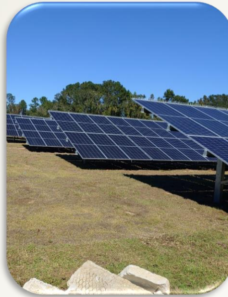
Solar Array at Treatment Plant

Garbage collection has recently been privatized and is going well.